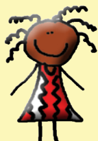
jukana female cousin