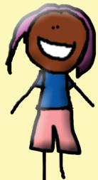
pimirdi father's sister