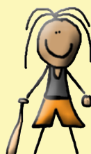
kapirdi older sister