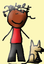
wankili male cousin