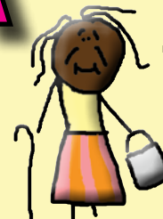
jaja mother's mother