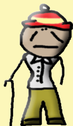
warringiyi father's father