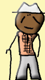
jamirdi mother's father