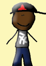
wankili male cousin