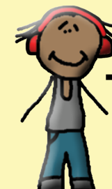
ngamirni mother's brother