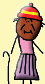
yaparla father's mother