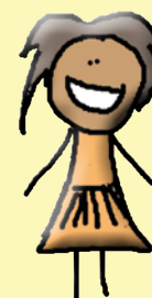
ngati mother's sister